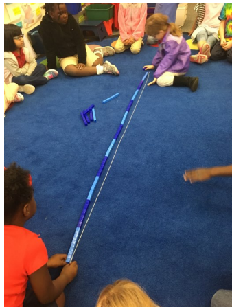
Measuring the average wingspan of a bald eagle.

We have worked hard on our STEM projects to be ready for our AdvancEd STEM accreditation visit next Monday and Tuesday! The visitors will be observing in the classroom, talking with the students, and assessing our work. Talk with your child over the weekend about what STEM means—Science, Technology, Engineering, and Math. Ask them to tell you about some of the many STEM related activities we have done this year! Here are some pictures of this week's activities!