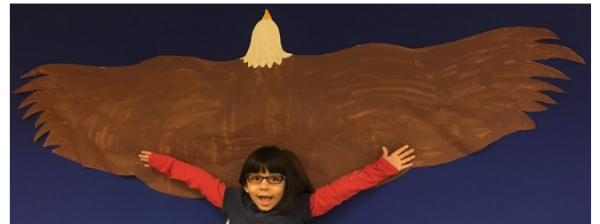
Comparing our arm length to an eagle's wingspan!