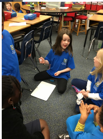
Brainstorming what our groups should include in our pool model!